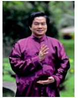
UHT System Founder Grandmaster Mantak Chia

This practical system serves to cultivate a healthy body, develop your soul and raise your spirits. Its main branches and core formulas cover meditation, Qi Qong, Healing Love Practices as well as martial and healing arts. It empowers individuals to develop physical, mental, emotional and spiritual potential in order to become their own healers and masters. The UHT is shared on 6 continents by its founder Grandmaster Mantak Chia as well as the global UHT Faculty with over 900 certified instructors and practitioners. Its accessibility suits everyday western lifestyle and allows every individual to freely choose a joyful life of health, love and wealth.