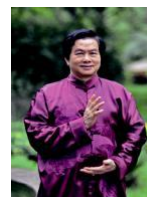
UHT System Founder Grandmaster Mantak Chia

This practical system serves to cultivate a healthy body, develop your soul and raise your spirits. Its main branches and core formulas cover meditation, Qi Qong, Healing Love Practices as well as martial and healing arts. It empowers individuals to develop physical, mental, emotional and spiritual potential in order to become their own healers and masters. The UHT is shared on 6 continents by its founder Grandmaster Mantak Chia as well as the global UHT Faculty with over 900 certified instructors and practitioners. Its accessibility suits everyday western lifestyle and allows every individual to freely choose a joyful life of health, love and